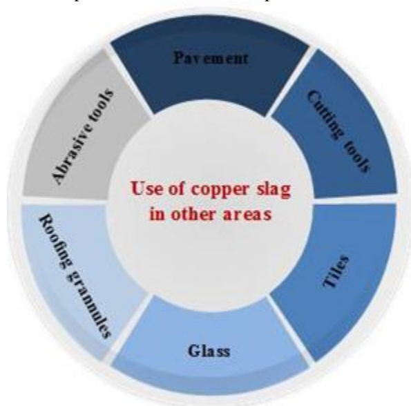
Figure 1. Pictorial representation of copper slag used in relevant field (Nataraja et al. , 2014)

The figure 1 depicted the pictorial representation of copper slag which can be used up in different field. It is been used in abrasive tools, in roofing granules in tiles and glass manufacturing copper slag is also used in cutting the tools and in pavement.