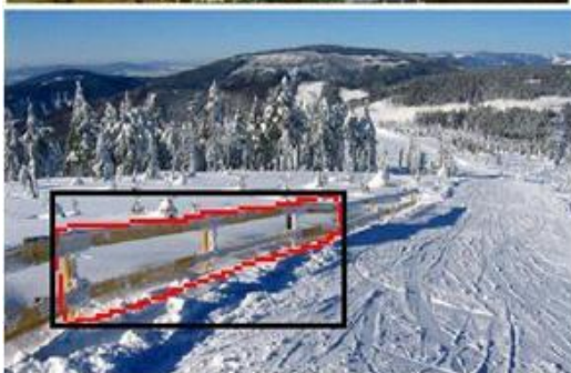
Fig (c). Cited from Ref no [1]

Now figure(a) & figure(b) shows the original images. Figure (c) shows the user selected gestures.