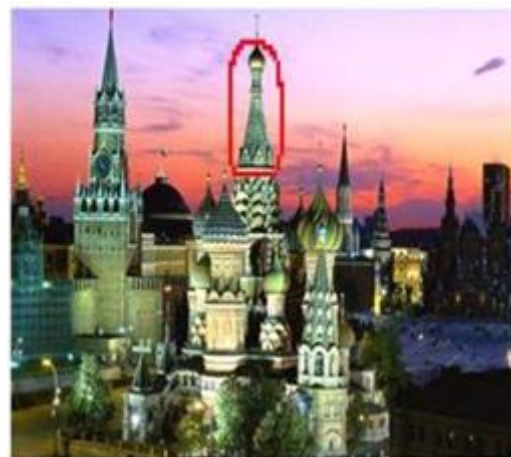
Fig (a). Cited from Ref no [1]

user selects regions in every image and remembers its position and size in that sequence and this information is stored in the database for future login purpose. At the time of login the sequence of images given to the user one by one which was saved at the time of the registration. Now the user selects the region with the gesture that was used at the time of registration. For every image, our algorithm calculates the parameter's and matches with the previously stored parameter's for that image with some tolerance value. If the match is a success then next image is fetched from the database and the process is repeated and if the match is unsuccessful then the user is not notified until the end and at the next sequence a random image is given to the user and login fail flag is activated.