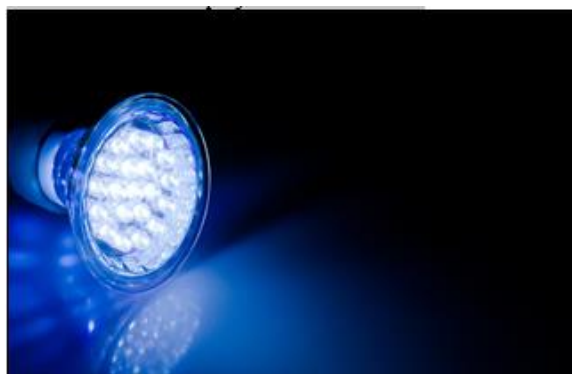
Fig.1 Li-Fi LED bulb