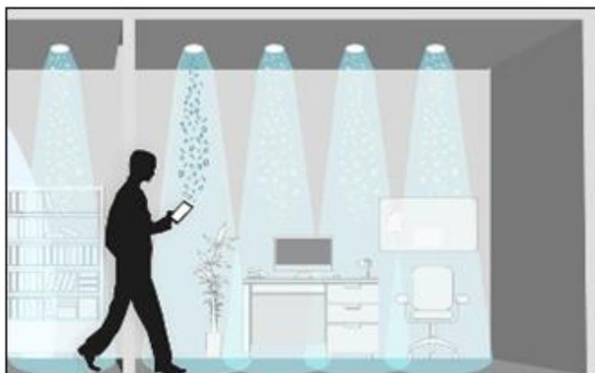
Fig. 5 Application of Li-Fi

4) Security is another benefit, he points out, since light does not penetrate through walls.