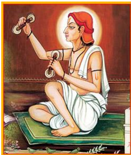
Fig. 7 Bhakta Narsinh Mehta - from Gujarat, India.

According to Gurudev R. D. Ranade, a bhakta (devotee) is markedly different from a sant (saint or mystic). A saint aspires to be one with the One. But a devotee is immersed in the ocean of devotion, where there is total surrender and immense joy in bhakti (devotion); here the distinction always remains between the devotee and his God.