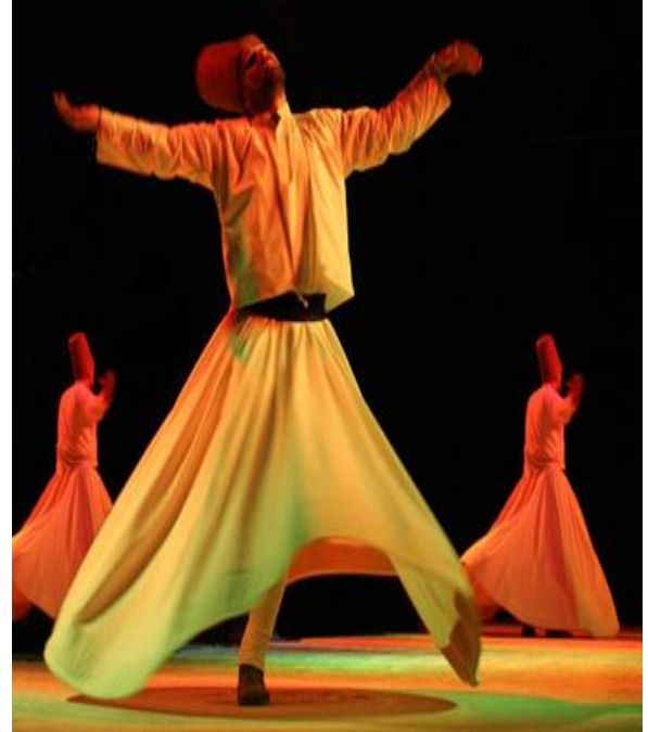
Fig. 8 The Sufi Dervishes

different from the Islamic identity of other Muslim countries. This is unique Indo-Islamic identity that has evolved over centuries – influencing every aspect of life. The influence of Islamic tradition on other religions and vice-versa, also led to evolution of unique socio-religious traditions of the Muslims in India. (Islam by Kaleem Kawaja, 2008).