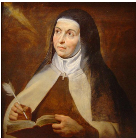
Fig. 9 Christian mystic saint Teresa of Avila

Let us have an aerial view of the points of similarity and differences between the mystics of East and West. R. D. Ranade finds a parallel between Jnanesvara's work (i.e. Jnanesvari ) and Plotinus, Eckhart and Augustine's work (i.e. Enneads, Mystische Schrifften and De Civitate Dei – respectively). Both the mystics of West and East show the philosophic and mystical wisdom in their work but the untouchable mystic of East, say Chokhamela, a pariah, has less of philosophical introspection, and more of dictates of heart; while Bohme of West show more philosophical bent and less intervention of heart. This is the difference that we do find. Again, women mystics of East like Muktabai, Janabai, Kanopatra differ in temperament from Western women mystics – like Julian of Norwich, Catherine of Siena, and St. Teresa. The Indian women mystics tend to be more subjective; while Western women mystics have been more purposeful in their activity