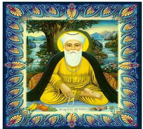
Fig. 2 Mystic Guru Nanak Devji