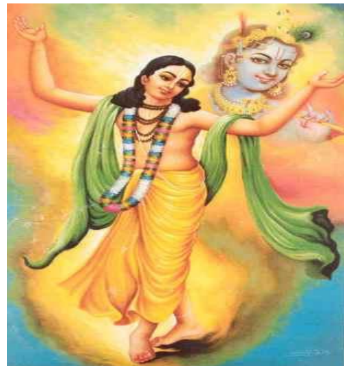
Fig. 10 Saint Chaitanya Mahaprabhu

A mystical union is the immediate transforming experience of the unification of man's soul with the Highest Reality. This is indeed the most authentic ascent of the human spirit. Mystical experience is an experience of enlightenment and exaltation of spiritual insight. As the great mystic Chaitanya Mahaprabhu says, 'O God, I do not pray for wealth or resources of family or social relationship, or for a beautiful wife or the blessings of the muses. May I attain and retain through the cycle of births and rebirths of the devotion of Thee, untainted by selfish motive.' It is obvious that theistic mysticism (or bhakti marga or Sufism) has exerted lot of influence on society. Through theistic mysticism we can develop interfaith dialogue and solve many of the contemporary social crises which have created havoc in the world.