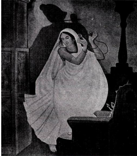
Fig. 4 Meera and Krishna