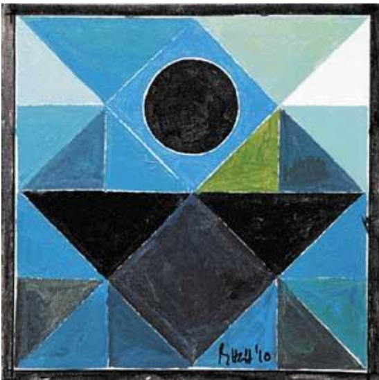
Fig. 3 Mystical painting by renowned painter S. H. Raza

Mysticism: Mysticism is dependent upon mystic's intuitions, insight or is claimed that he has a direct intuitive perception of God. There are two types of mysticism; one is atheistic mysticism (that which is not our topic of discussion) and theistic mysticism (that has God as the central principle of belief in mystical experience). The mystic firmly believes that his experience is so unique that it cannot be described, defined, explained or demonstrated. This is so because God is such a unique Being, that no pronoun can describe God. The moment we ascribe characteristics to God, we are conceptualizing Him for we already have a concept of something and we attribute to God the characteristic of which we have concept. Then what can be said about God? The answer is we can say nothing of God because the moment we say something, we are ascribing some qualities to God, we are limiting God to that concept. Then we commit the fallacy of anthropomorphism; that is where we designate human attributes to God, thereby limiting God. No words, not even the words such as infinite, limitless can be ascribed to God. Even the word 'God' is not allowed and yet when a mystic make such a statement as 'God is the unity of all things'- is not using the term literally but only symbolically.