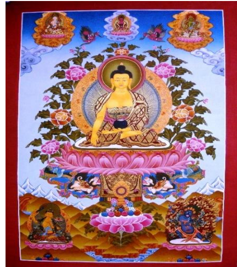
Fig. 5 Tibetan Buddhist Thangka

school of thought, that is Jainism, Buddhism and Upanishads emphasized on individual effort, rather than the authoritative priestly community. So, it came as a rebellious movement against Vedic religion. Even the two great epics – the Ramayana and the Mahabharata are abundant with bhakti; in Mahabharata– the relation between Krishna and Arjuna is an ideal example. In Buddhism and Jainism too - one finds the devotee has great reverence and awe for Buddha and Bhagawana Mahavira respectively.