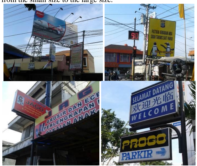
Fig. 2. The Size of Signages on Mayor Suryotomo Street

variety of signages size on Mayor Suryotomo Street, varied from the small size to the large size.