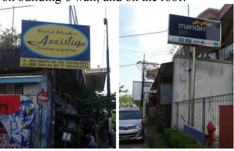
Figure 4 below shows the variety of signages location on Mayor Suryotomo Street, varied from on the sidewalk, outdoors, on building's wall, and on the roof.