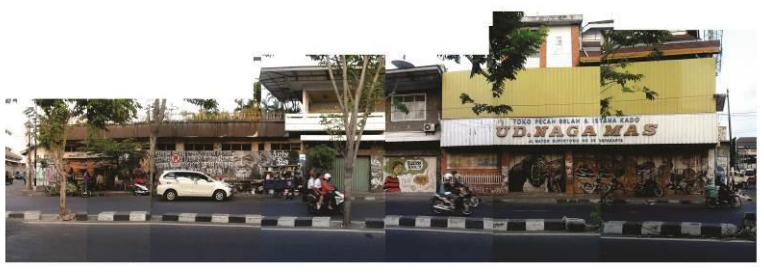
Fig. 10. Montage of Segment III-West