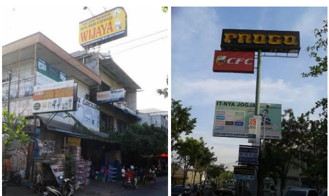
Fig. 3. The Height of Signages on Mayor Survotomo Street

Table III shows that there is still 1 signage having height that is not suitable with the standard. This case can be an evaluation for the government to improve the size of existing signages and the signages that are going to be installed on the corridor. Figure 3 below shows the variety of signages height on Mayor Suryotomo Street.