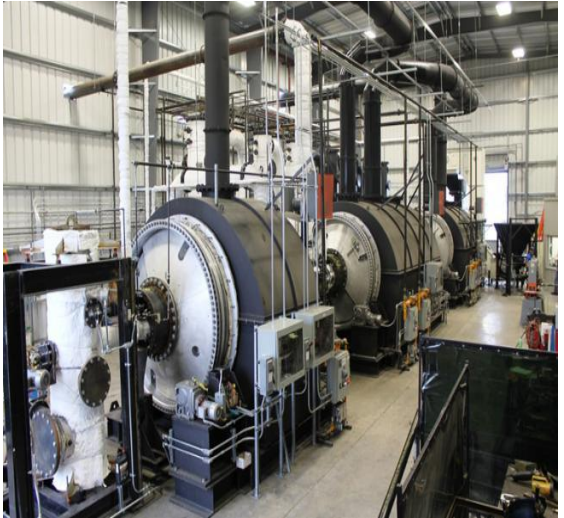
Fig3. A plastic to fuel conversion plant at JBI, Inc., NY.

www.ijtra.com Volume 2, Issue 5 (Sep-Oct 2014), PP. 89-90 III. CONCLUSION