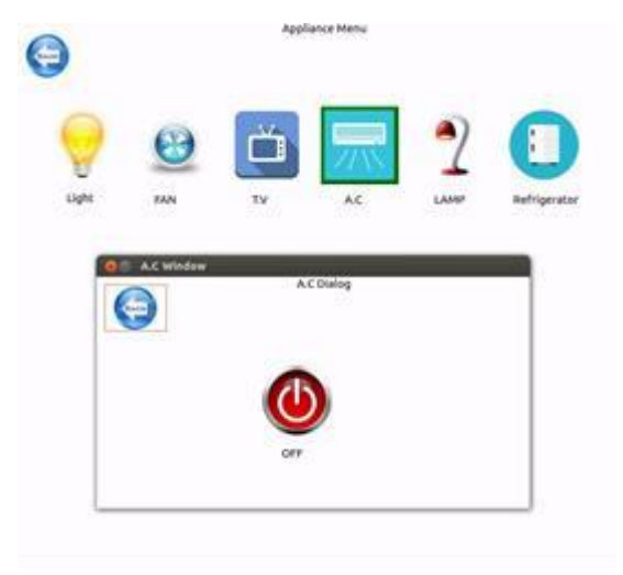
Fig 6. Home Appliances

www.ijtra.com Volume 4, Issue 3 (May-June, 2016), PP. 89-92