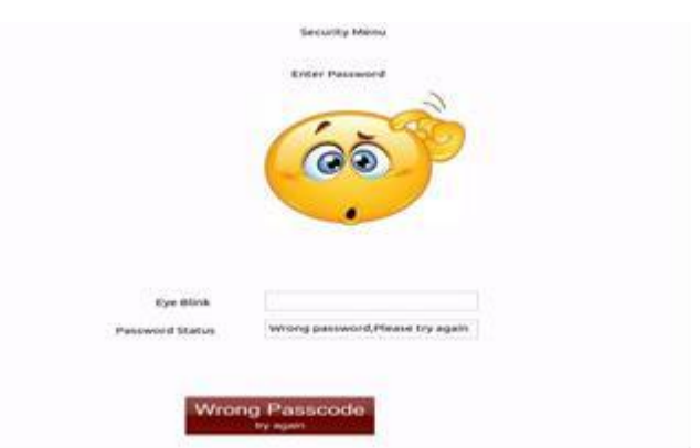
Fig 2. Security