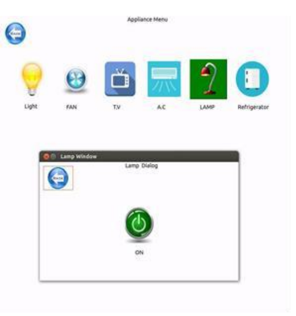
Fig 5. Home Appliance