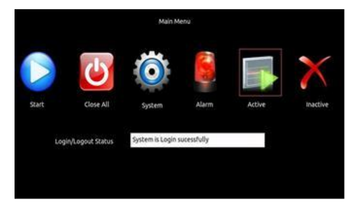
Fig 4. Main Menu