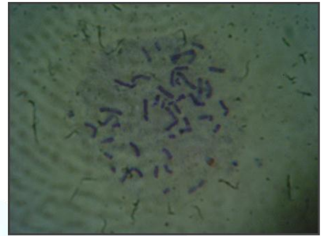
Figure 2: Normal karyotyping of human chromosome at different concentration of 70 % ethanolic extract of Portulaca oleracea, XY, G-band (400X).

Other plant compound may decrease lymphocyte proliferation such as dopamine. Dopamine receptors (D1 and D2) are known to be on many cells of human body. Lymphocytes have these receptors (26). Activation D1 receptor in vitro by dopamine causing decrease T cell proliferation by degradation of nuclear factor-kappa beta (NF-KB) (27), because NF-KB appear to be among the transcription factors that have been implicated in the expression of a wide range of proinflammatory genes, dopamine induce immune modulation can be explained via this pathway (28).