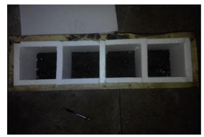
Fig 4.1 Empty wooden mould